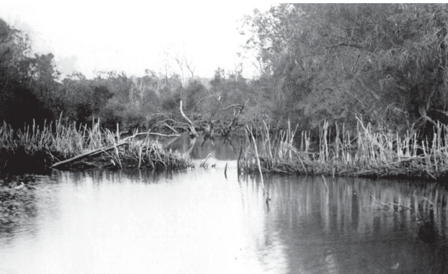
FIGURE 3 Aboriginal Fishtrap, Murray River, about 1900.

The name 'Boolyun' may well derive from boylya , which is one of several names for a sorcerer (cf. Moore 1884: 13). This fragment could well date to the mid or late 19th century, when Forrest was an extensively travelled explorer with an interest in Aboriginal life.